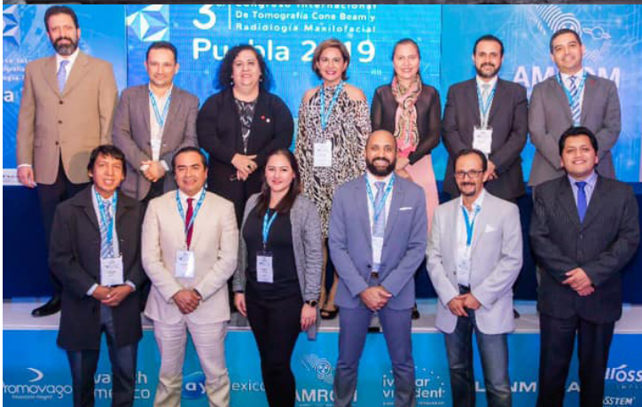
Some of the AMROM members, along with some of the international invited speakers, two deans of the most important Dental Schools in Puebla, and two IADMFR Latin American Directors