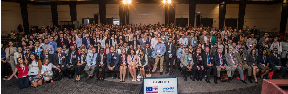
The 22nd ICDMFR Attendees

Chair of Organising Committee of the 22nd ICDMFR