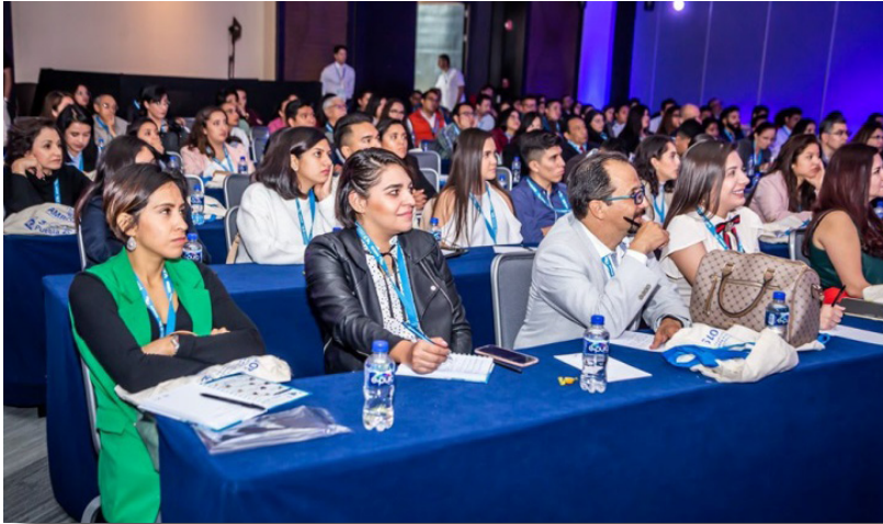
Congress attendees. Puebla, Mexico