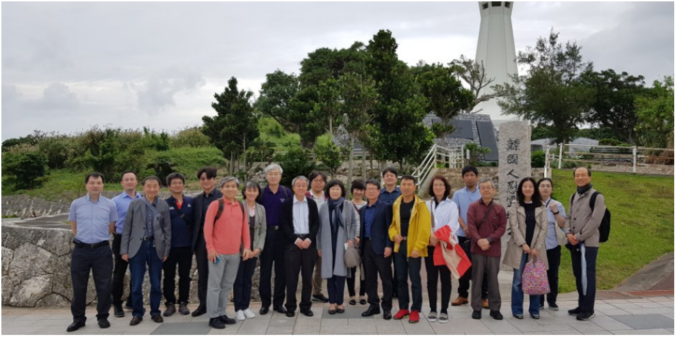
Fig. 3. Group photo at the 1st Japan-Korea International Conference of OMFR in Peace Memorial Park, Okinawa, Japan