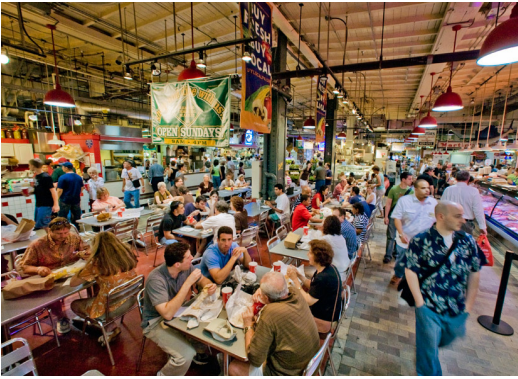
Fig. 5. Reading Terminal Market, Philadelphia