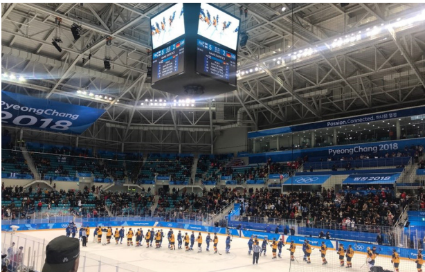
Fig. 2. This is an ice hockey match between Finland and Germany. Players are shaking hands after the game.