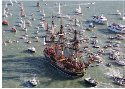
Fig. 6. Philadelphia-Camden Tall Ships Festival