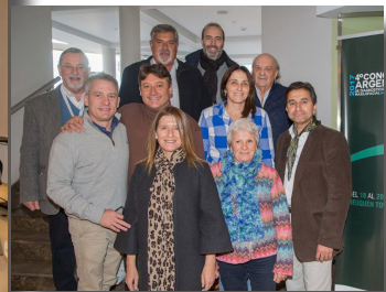
The Organizing Committee. Neuquén, Argentina.