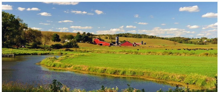
Fig. 3. Lancaster, PA