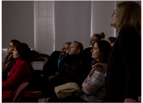
Fig. 4. Interested listeners at the EADMFR 5th junior meeting 2018 in Budapest.