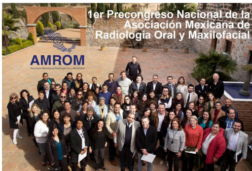
Some pre-conference attendees. 1st Congress of the AMROM. Pachuca, Mexico.