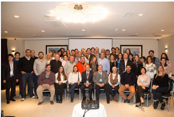
Participants of the 4th Argentinian Congress of Maxillofacial Diagnostic Imaging. Neuquén, Argentina.