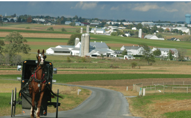
Fig. 2. Lancaster, PA

Chair of Organizing Committee of the 22nd ICDMFR