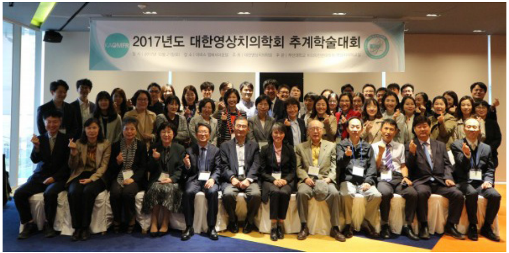
Fig. 1. Group photo at the Fall Scientific Meeting of KAOMFR in Busan, Oct 2017