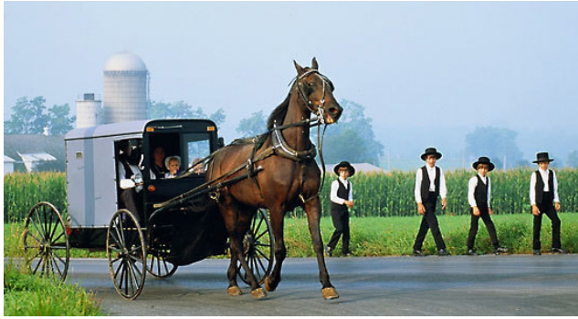
Fig. 4. Lancaster, PA