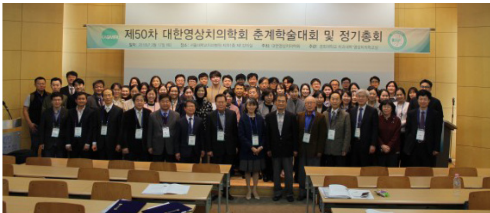
Fig. 6. Group photo at the 50th General Assembly and Annual Scientific Meeting of KAOMFR in Seoul on 17 Mar 2018