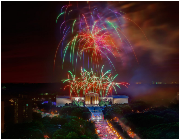
Fig. 7. Art Museum Parkway, Philadelphia on July 4th, National Independence Day