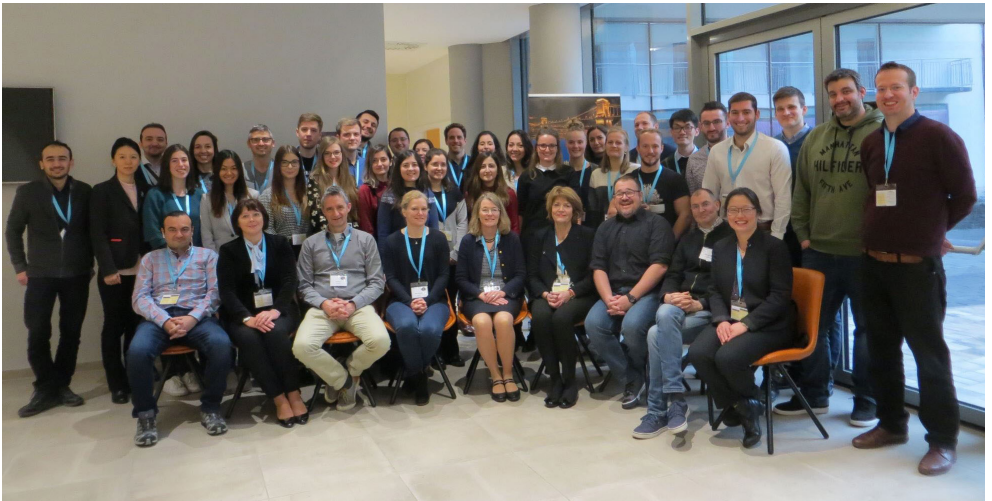
Fig. 1. Participants of the EADMFR 5th junior meeting 2018 in Budapest.