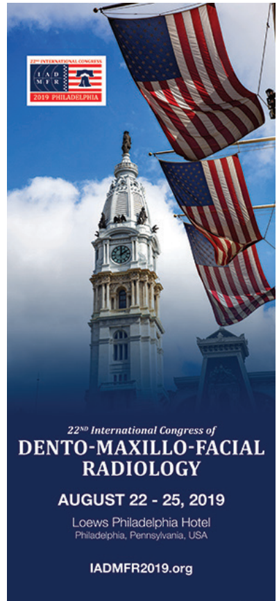
Fig. 1. Save the Date for the 22nd ICDMFR in Philadelphia, USA