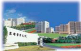
Kaohsiung Medical University (KMU)

Copyright & Related Issues It is accepted and agreed by all of the contributors to the Proceedings (ISBN: 978-986-95957-0-4) that the full accountability for all matters related to the scientific accuracy, medical and professional integrity rest with the authors and have been waived from the official Publisher. It is the individual contributor's responsibility and liability to maintain accepted standards regarding the copy right and related issues. No part of the present Proceedings may be reproduced in verbatim, stored in a retrieval system, or transmitted in any form or by any means, electronic, mechanical, photocopying or photocopied, recording or otherwise without the prior written permission of the official Publisher, TAOMFR, (address at: Oral and Maxillofacial Imaging Center, No.100, Shih-Chuan 1st Road, Kaohsiung, Taiwan, postal code: 80708). No responsibility is accepted by the official Publisher for any untoward result, following the use or manipulations of the instructions, data and ideas contained in the Proceedings.