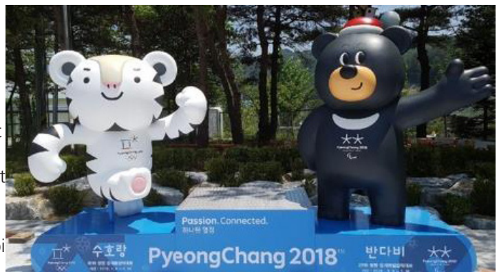
Fig. 3. On the left is Soohorang, the mascot of the Olympic Winter Games and on the right is Bandabi, the mascot of the Paralympic Winter Games. Bandabi took its motif from the Asiatic black bear, and is a warm-hearted friend who takes the lead for equality and harmony and encourages athletes to push themselves beyond their limits.