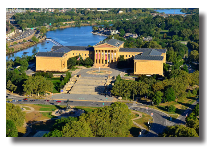
Fig.5: Philadelphia Museum of Art