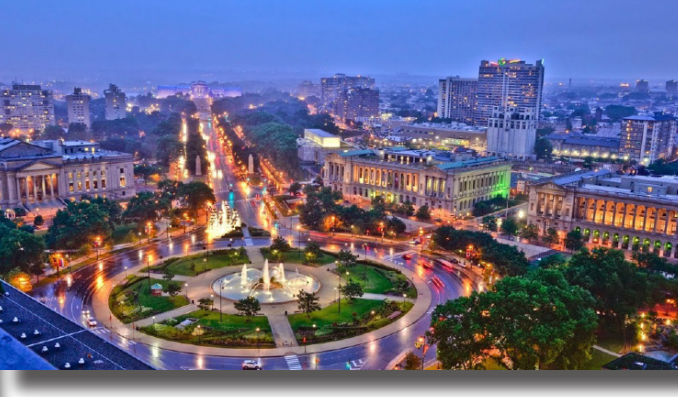
Fig.2: Philadelphia Skyline