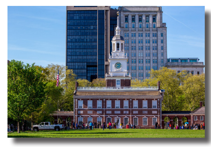
Fig.4: Independence Hall