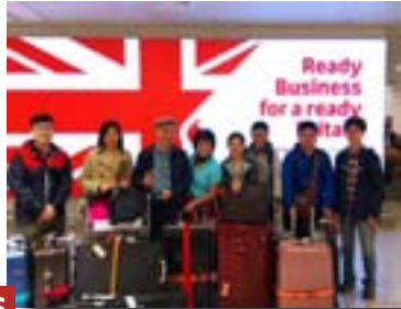
Heading for EADMFR at Cardiff

Besides the academic presentation, we aim to encourage people from Europe to participate in the 21st International Congress of IADMFR in Kaohsiung, Chinese Taipei on April 26-29 next year (see pictures at booth). We met many international friends (Poland, Romania, and Korea) at the Gala dinner in the great Cardiff Museum.