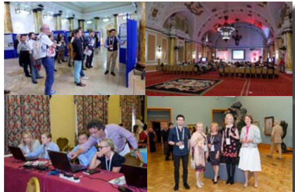
Delegates enjoying the poster session in the Marble Hall

Chair of Local Organising Committee for ECDMFR Cardiff 2016