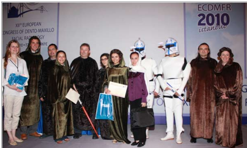
Participants and the judges from the special Junior Film Reading Session which was themed "Star Wars".