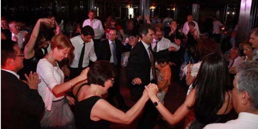
The participants enjoying the Gala Dinner party.

in the quiz. A certificate and small prizes were presented to both the teams and the winner of the audience after the session.