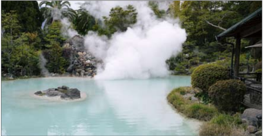
The Jigokudani hot spring in Beppu, Kyushu.

allowed to wear a swimming suit in the hot springs. As they say, “When in Rome, do as the Romans do”. Will you try? The Jigokudani hot spring in Beppu, Kyushu is only 2.5 hours away from Hiroshima by Shinkansen (Bullet train) and the usual express train. I recommend Beppu, as one of the best hot springs for foreign visitors to enjoy.