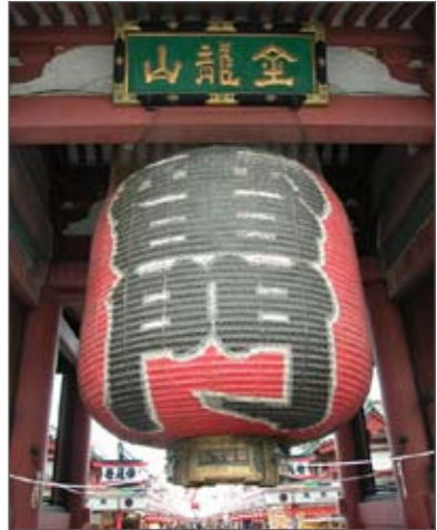
The gate of Sensoji Temple, Asakusa Kaminari-non in Tokyo.

As you know, Japan is a beautiful country with breathtaking scenery, centuries of history and stunning architecture. There are many great places you can visit when you are in Japan.