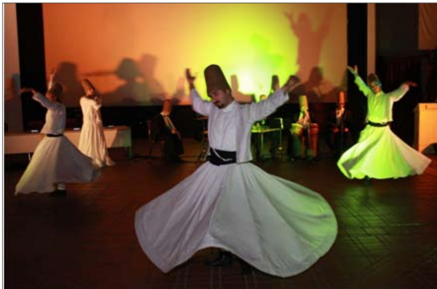
The whirling dervishes during the opening ceremony.

In Europe, the most important event for the Dentomaxillofacial Radiology community in 2010 was the 12 nd European Congress, held in the beautiful city of Istanbul from June 2-5, 2010. The ECDMFR congress welcomed over 400 participants from 24 countries. Overall 290 abstracts were submitted to the congress, from this 260 were accepted to be presented. Throughout the congress, there were 84 oral presentations and 176 posters from all fields of dentomaxillofacial imaging. However, due to restricted time and space, many papers submitted for oral presentation had to be assigned for poster presentations. The general standard of the papers was high. Moreover, as the main aim of the Local Organizing Committee was to invite experts from scientific discipline adjacent to radiology, nine keynote lectures from not only Europe, but also from USA and Japan, were invited to present lectures on different topics.