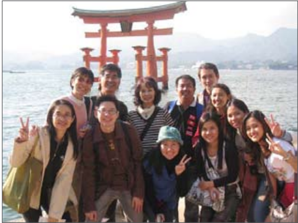
Miyajima Island. Khon Kaen friends in front of the Big Torii in the sea.

island of Miyajima (also called Itsukushima) has been worshipped as a god. This belief, passed down from generation to generation, has protected the Itsukushima Shrine, as well as the many other shrines and temples that are unique to the island's culture, and