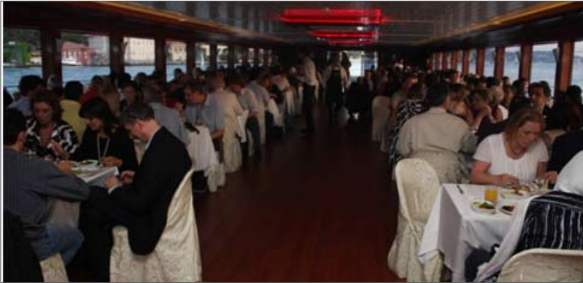
A scene from the Bosphorus boat tour. The participants enjoyed passing from Asia to Europe during the meal.