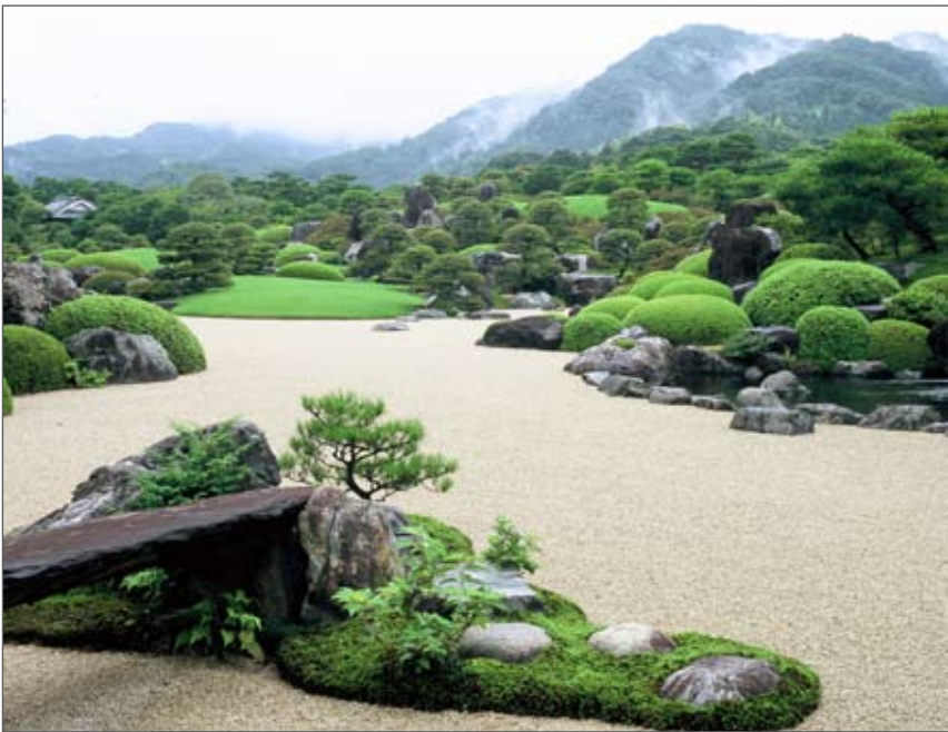
Serenity and beauty - the Japanese garden. Adachi Museum of Art.

We are planning a trip to Adachi Museum of Art as an optional post-congress tour. It has been awarded the title of the best Japanese garden for the last seven years, and it is situated northeast to Hiroshima. It takes four hours from Hiroshima by bus (coach). In addition, they will open a new exhibition area for modern Japanese art this fall. You will stay at the Onsen Ryokan,