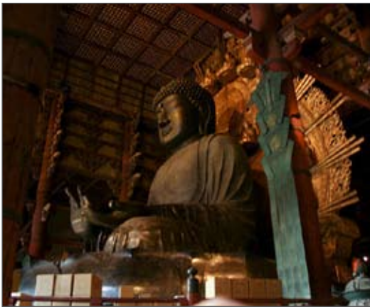
Daibutsu, Big Buddha in Nara.

around. Many old famous temples and ancient burial mounds are scattered in that area. The Daibutsu, Big Buddha, which is about 15 meters tall, is one of the remarkable sites in this ancient city.