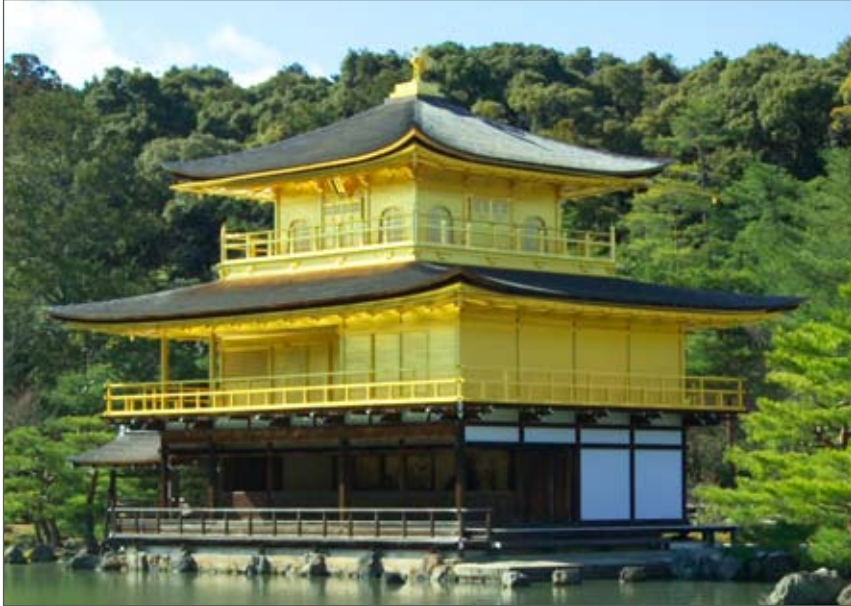
Kinkaku-Ji (Golden Temple), Kyoto.

around. Many old famous temples and ancient burial mounds are scattered in that area. The Daibutsu, Big Buddha, which is about 15 meters tall, is one of the remarkable sites in this ancient city.