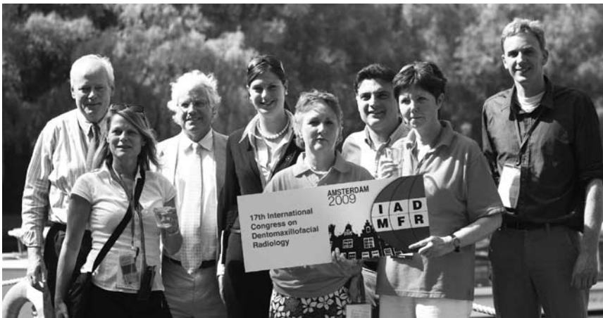
17 th ICDMFR organizing team captured at the farewell party.