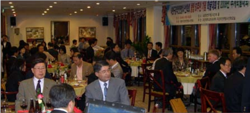
The dinner party of the 50th anniversary of KAOMFR.