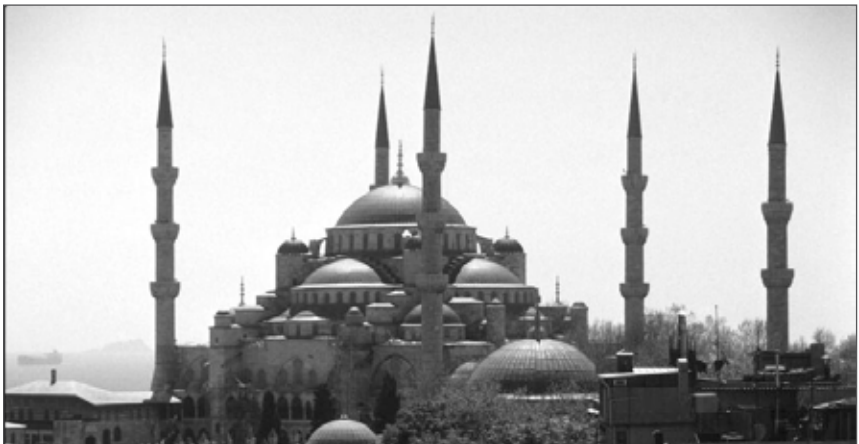
The Blue Mosque, symbol of Istanbul

But the first time to meet again will be in Istanbul from June 2-5, 2010. We are all getting ready for this unique event in one of the most multicultural and cosmopolitan cities in the world. In 2010, Istanbul proudly carries the title of European Capital and we are convinced that an attractive scientific,