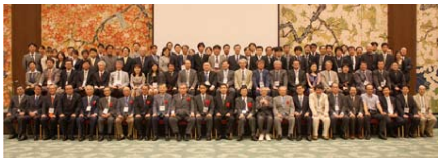
The 50th Anniversary Congress of JSOMR