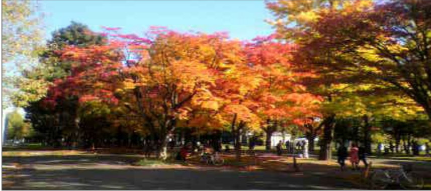
The 14th Annual Congress of the Diagnostic Imaging Division at Hokkaido University