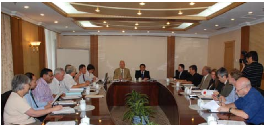
Board Meeting of the IADMFR held on June 24, 2007.