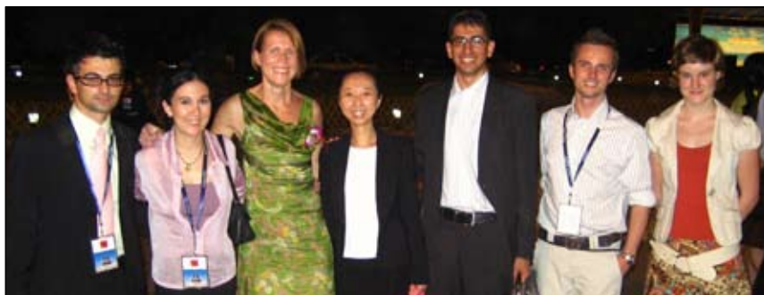
ICDMFR delegates coming from 6 different countries with one common factor: the Belgian link